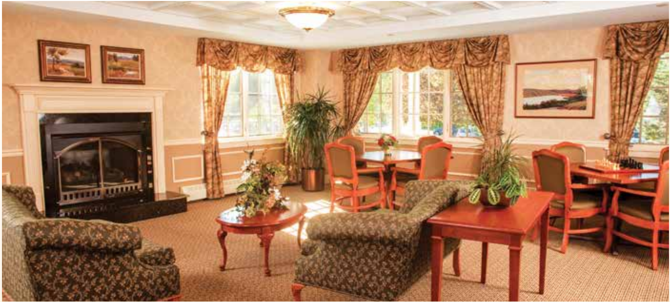
Family gathering lounge

Friendly Home's excellent reputation for providing quality care is marked by our ability to adapt to the needs of those we serve while remaining dedicated to the purposes of our founders. As leaders in our field, we are committed to serving an increasing aging population as it changes and grows.